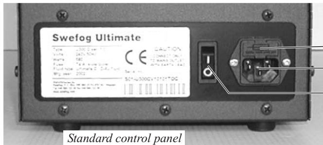
Standard control panel